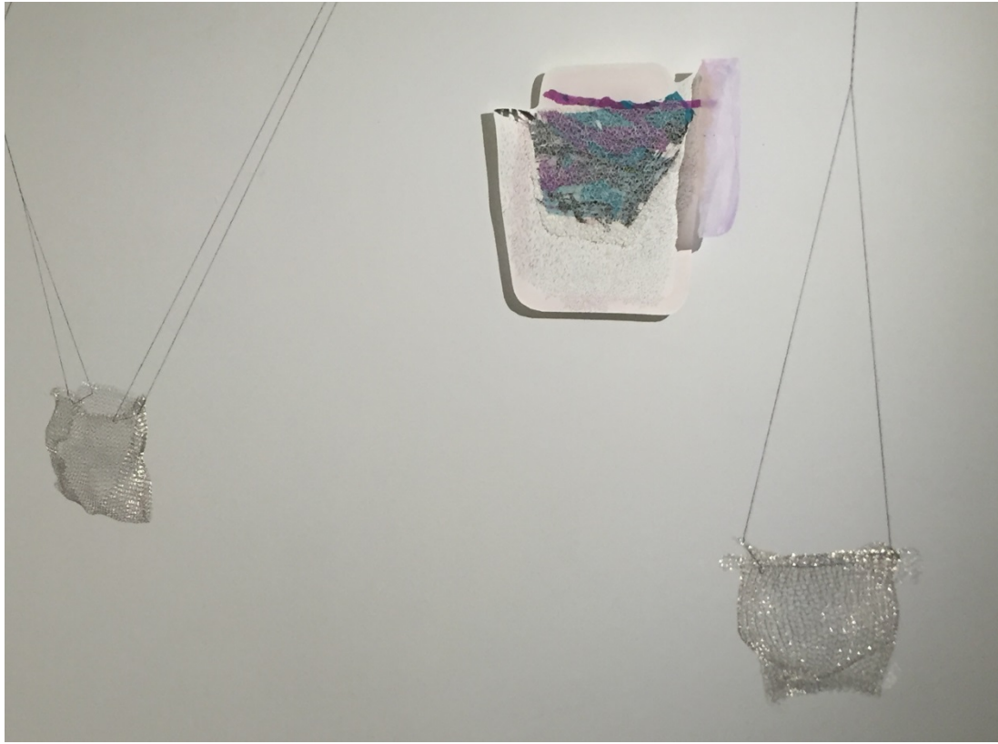
Figure 4. Detail of Nests , by Merel Visse

Nests is a three-dimensional installation that consists of several objects (nests) made of mixed materials (ink, textiles, and watercolor on paper, thread, and metal). The nest can be a symbol of the isolation and seclusion of health care experiences, on the one hand, and a symbol of connection and community, on the other.