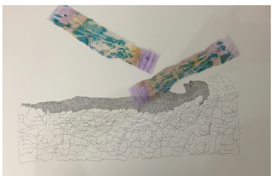
Figure 1. Detail of Untitled, by Merel Visse

This project presents research-based art works that inquire into the tensions in everyday life from an ethical viewpoint of care, which sees people as embedded, "nested" in care-based relationships. Trust is the glue that holds these "nests" together. Care is the air that lifts them up, but tensions exist as well—between dependency and autonomy, vulnerability and strength, for example. The pull of these ideas exist in a kind of "check" and run through our relations and being.