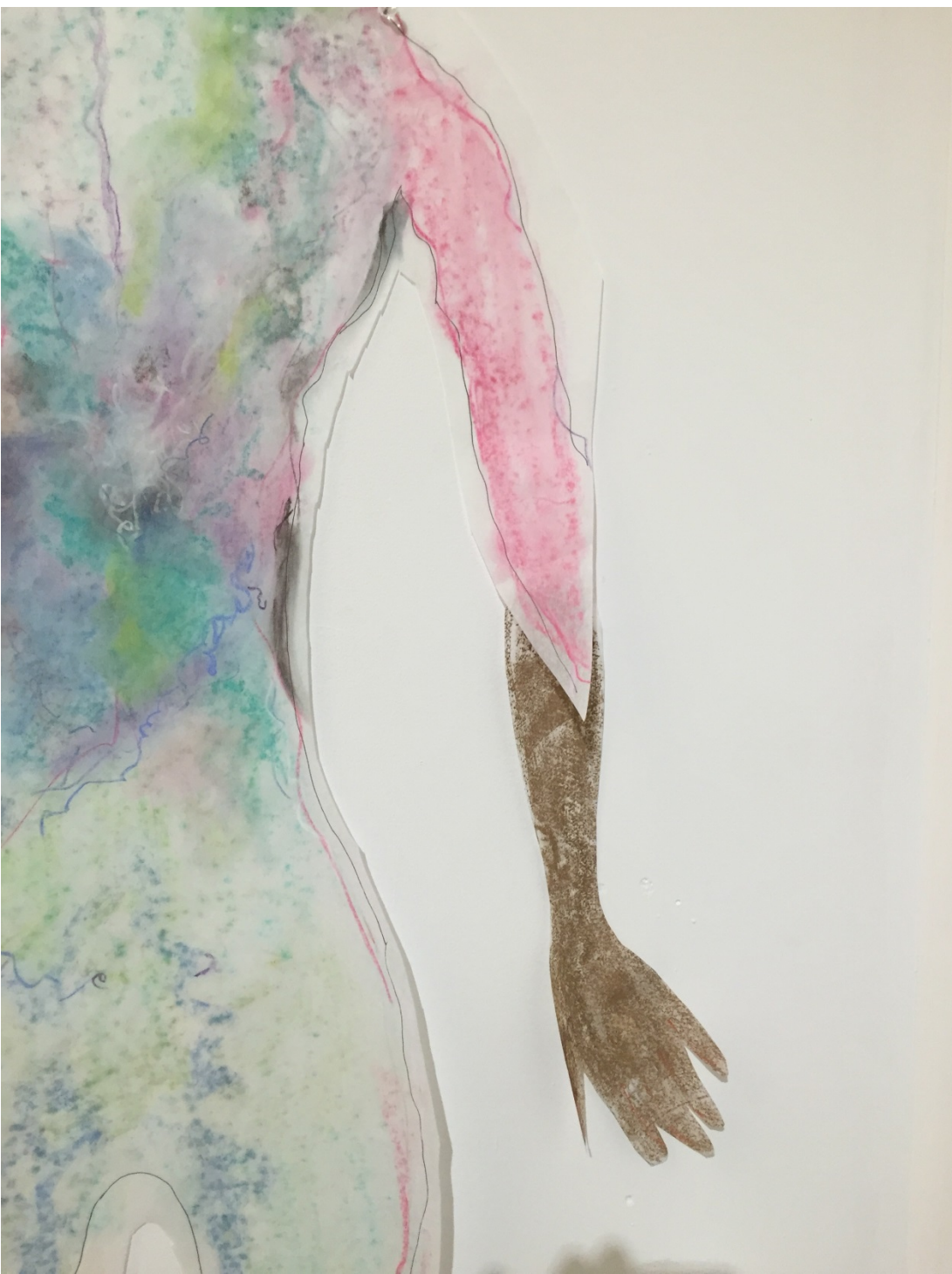
Figure 5. Detail of Interdependence, by Merel Visse

This wall object (ink and pastel on transparent paper) explores our dependence—a function of our bodily fragility—and our interdependence. It illustrates how my husband and I—him being black, me being white—are interdependent and how that interdependence constitutes my body and well-being. Care ethicists often speak about