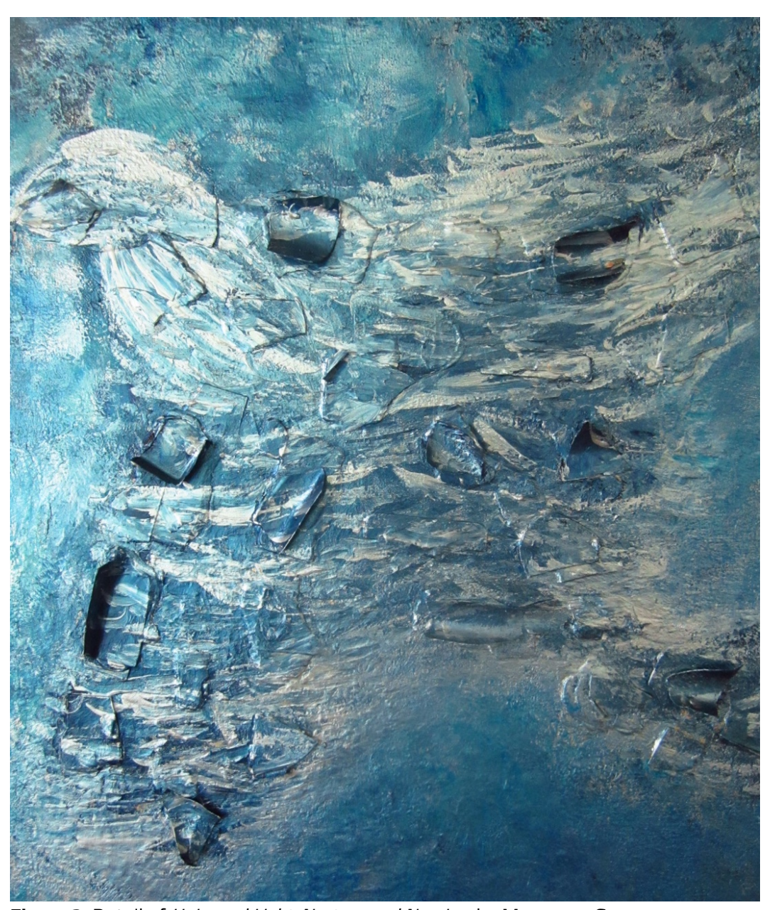
Figure 2. Detail of Universal Light, Nurture and Nursing , by Margeaux Gray