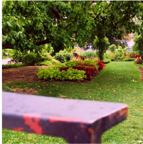
Figure. The Healing Bench , 2020