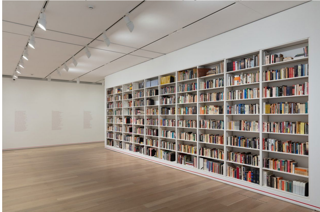
Figure 5. Installation view of Debris Fields , 2014, and Selections From Gregg Bordowitz’s Library , 1983–2011, by Gregg Bordowitz. Installation view: Gregg Bordowitz: I Wanna Be Well . Art Institute of Chicago, April 4 to July 14, 2019, Chicago, Illinois.

efforts to cultivate resilience and strength. In his lecture, Bordowitz stated that the “personal part is about plurality. It shouldn’t evolve into the singular. It should resonate and vibrate with shared experiences.... Art constitutes a great vitality of our lives.” 7