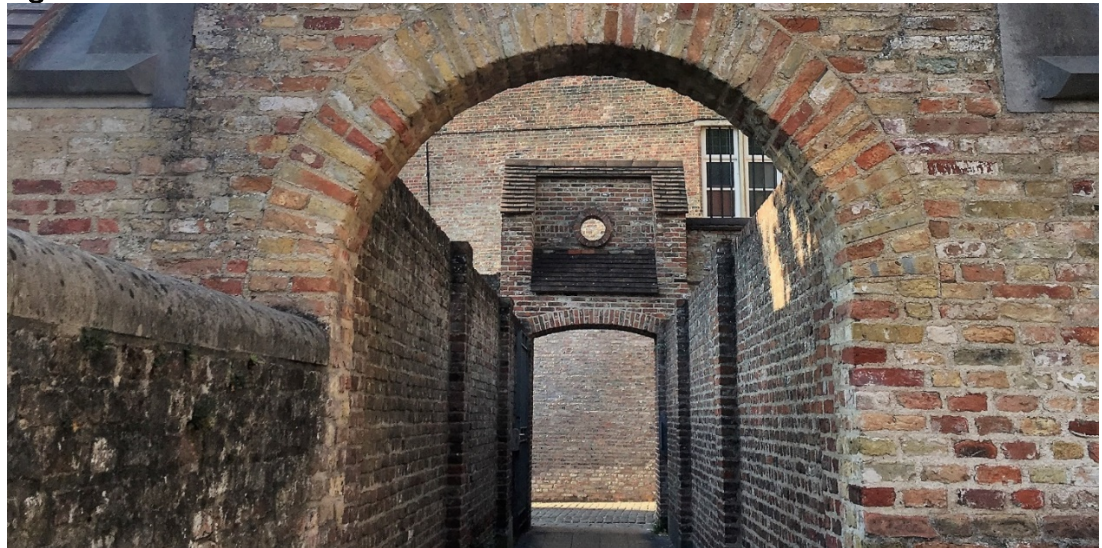
Figure. Arches of St John's

This photograph depicts a gateway at the Oud Sint-Janshospitaal, a medieval Flemish hospital. This hospital was open to the poor and sick, helping to make health care accessible to the surrounding community. Just as it was in the Middle Ages, health care access is a salient issue today.