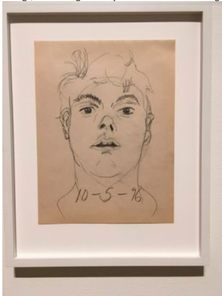
Figure 4. Detail from Self-Portraits in Mirror , 1996, by Gregg Bordowitz. Installation view: Gregg Bordowitz: I Wanna Be Well . Art Institute of Chicago, April 4 to July 14, 2019, Chicago, Illinois.

In contrast to Gonzalez-Torres' metaphorical and conceptual approach, Bordowitz's work and poetics are explicitly activist in tone. Self-portraits that Bordowitz drew as he lost weight when he was first treated for HIV (see Figure 4) might, on one interpretation of "Untitled" ( Portrait of Ross in LA ), evoke the similar experience of Gonzalez-Torres' partner.