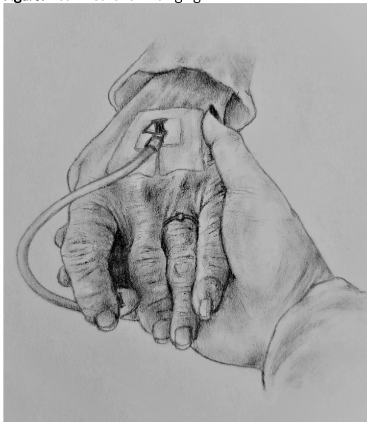
Figure. Health Care for the Aging

Good health care for elders requires acute ethical attention to the role of ageism as a pervasive source of bias. A charcoal drawing of one older woman's hand visually examines the nature and scope of younger caregivers' responsibilities to geriatric patients and their loved ones.