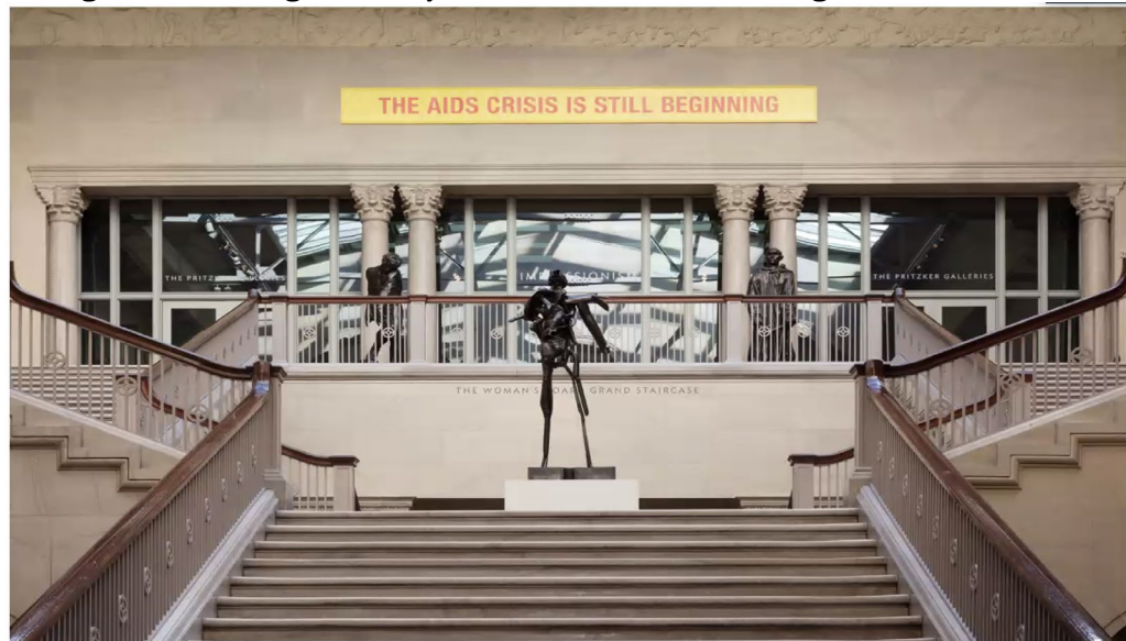
Figure 3. The AIDS Crisis Is Still Beginning , 2019, by Gregg Bordowitz. Installation view: Gregg Bordowitz: I Wanna Be Well . Art Institute of Chicago, April 4 to July 14, 2019, Chicago, Illinois.

Ongoing struggle for health and human rights was the topic of a virtual lecture that Bordowitz gave at the School of the Art Institute of Chicago just as the COVID-19 pandemic started to unfold in the United States in 2020. While discussing his artistic and activist work, he said: “I was doing it, I am still doing it, and my work is an example of how catastrophes get represented, normalized and not really resolved, how the spotlight moves on.” 5 In his recent retrospective show, I Wanna Be Well , 6 Bordowitz included a giant banner: “THE AIDS CRISIS IS STILL BEGINNING.” And, like the motto “Black Lives Matter,” this motto compels us to listen, pay attention, look back into history, learn from it, and, more importantly, take action.