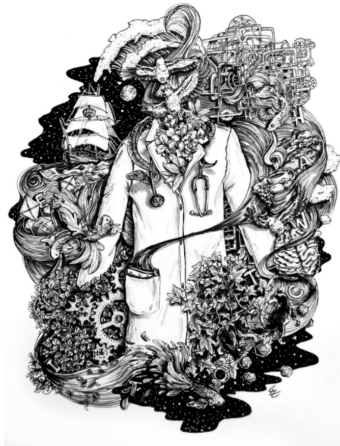
Figure. A Living Symbol

White coats are symbols of power that express historically entrenched ideals of clinical purity, sterility, and control. These ideals tend to oversimplify ethical and clinical complexities inherent in evolutions constantly taking place in health care practice. This pen and ink drawing interrogates these ideals visually and reimagines the white coat in the context of more realistic dynamism.