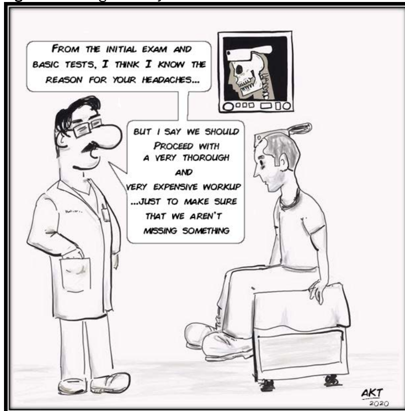
Figure. Choosing Unwisely

This comic visually conveys the absurdity of overreliance on symptom measures and excessive testing in contemporary clinical decision making and health care practice.