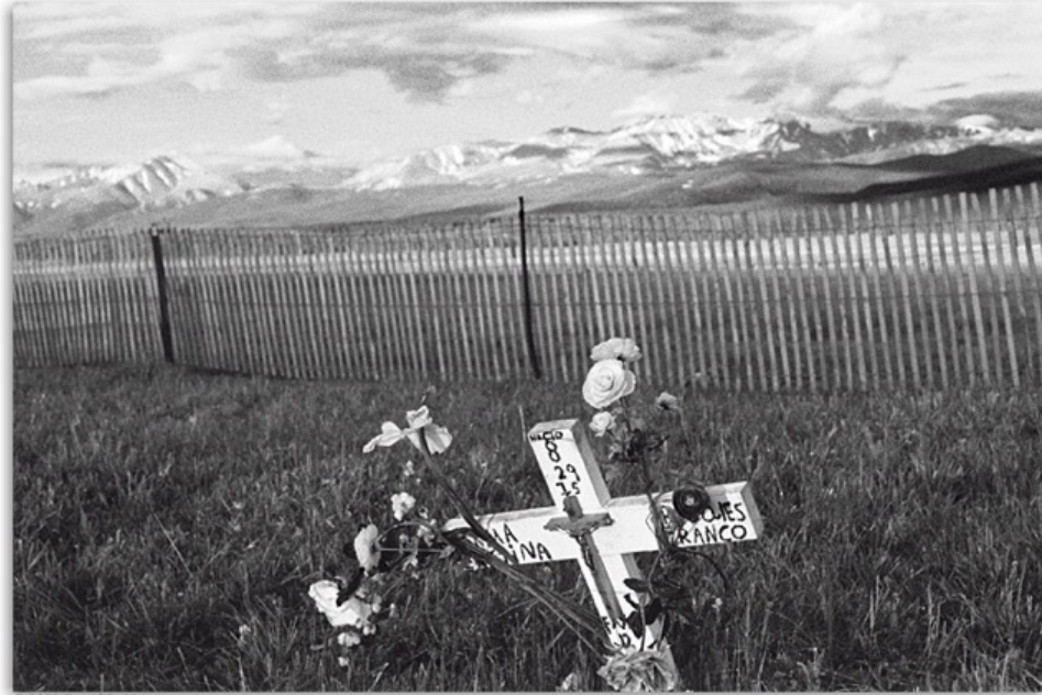
Figure 3. nacio 8 29 75 .